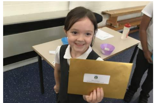
Another lucky winner at our attendance assembly!