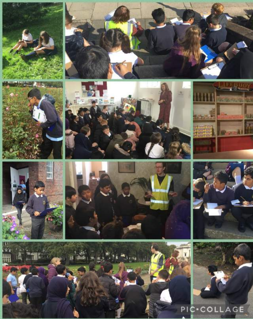
Year 6 had a fantastic trip to Port Sunlight where they learned about how the land use of the area changed over time. They also visited the Port Sunlight Museum, The Edwardian's Workers Cottage and Soapworks.