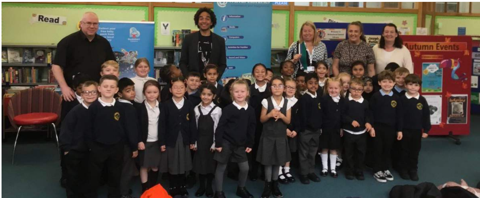
Year 1 enjoyed a trip to the library where they met author and poet, Joseph Coelho. He inspired them to write their own stories back at school.