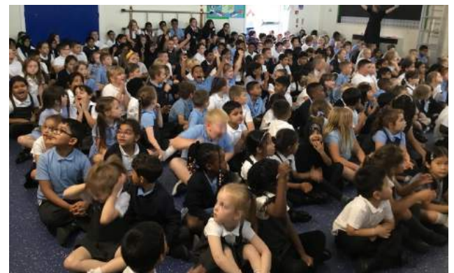
There was much cheering when Turing class had another 100% attendance week as well!